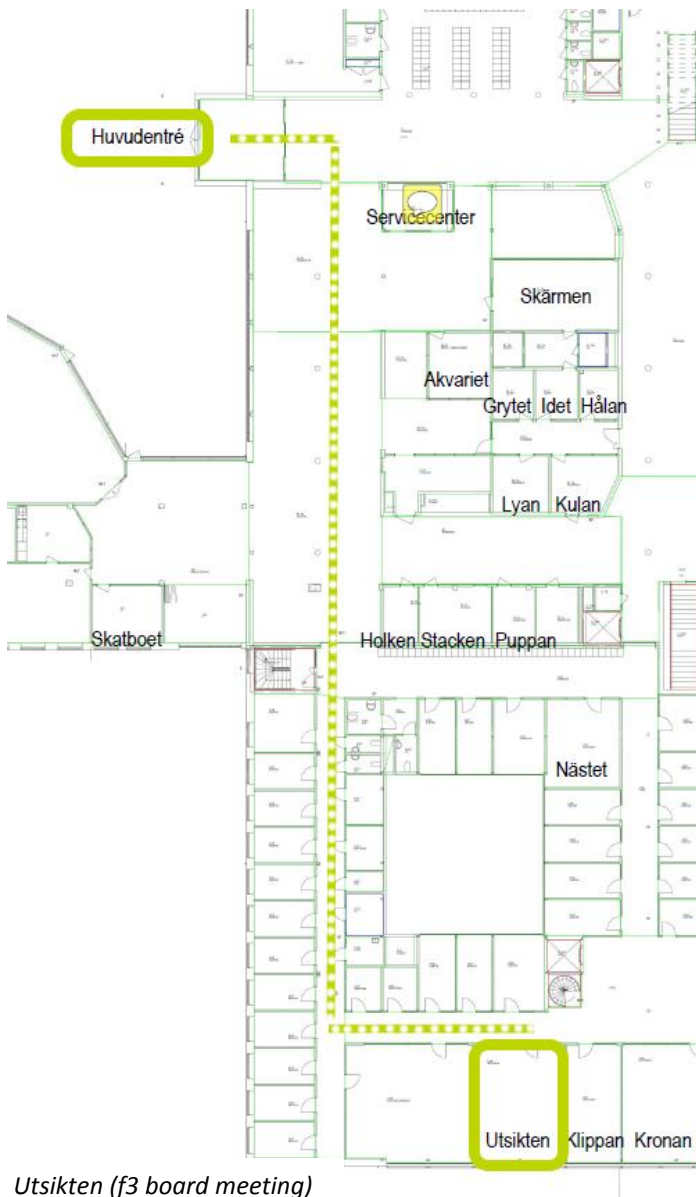
Utsikten (f3 board meeting)

The board of f3 will meet 5-6.30 pm in the meeting room “Utsikten” at SLU Umeå. The room is located at the third floor in the same building as the seminar venue (see map below for directions).